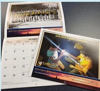
Photo entries due March 30, 2019 to sjpsfoundation@sjschools.org