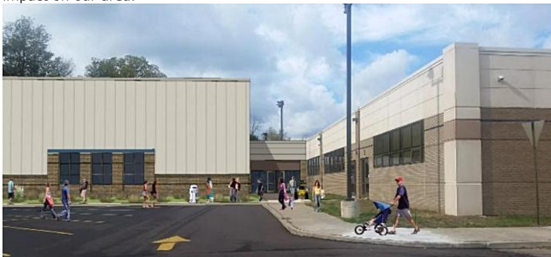
Architectural Rendering of the Edward J. Todd Innovation Center at St. Joseph High School